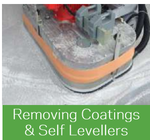
Removing Coatings & Self Levellers