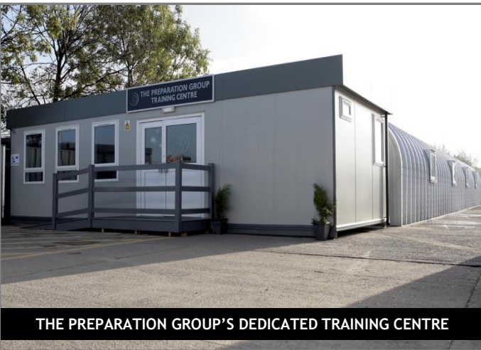
THE PREPARATION GROUP'S DEDICATED TRAINING CENTRE

As a statutory requirement all equipment purchased from The Preparation Group is accompanied by basic operational, maintenance and safety training.