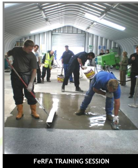
FeRFA TRAINING SESSION

The Preparation Group's dedicated Training Centre is unique in that it has a fully equipped lecture room and a practical operation area comprising of over 300m 2 of different surfaces. This, combined with a large range of equipment, enables delegates to experience an infinite variety of applications and processes including; shotblasting, planing, grinding, multi-stripping, surface removal, cleaning, texturing & polishing .