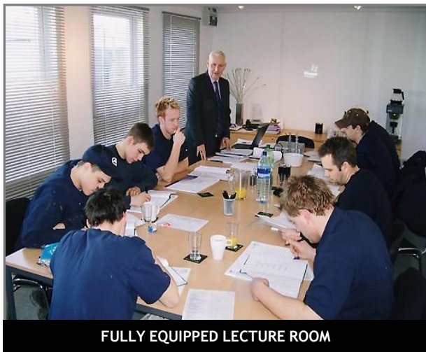
FULLY EQUIPPED LECTURE ROOM

Selection of the best training is vital. The Preparation Group's courses are designed to provide the essential product knowledge and application skills that help delegates work more efficiently and improve their business's bottom line.