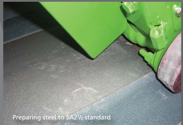
Preparing steel to SA2½ standard