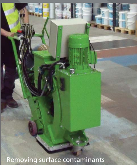
Removing surface contaminants