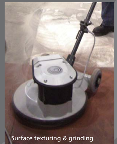
Surface texturing & grinding