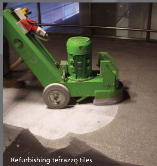
Refurbishing terrazzo tiles