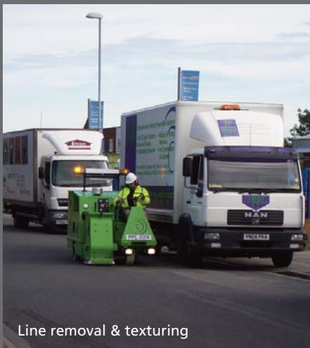
Line removal & texturing

The Preparation Group's contracting division PPC, is the market leader in surface preparation and surface removal, with over 250 years of collective management experience in the industry and an unrivalled knowledge of preparation methods and techniques. Established in 1991, we have removed, prepared, polished and cleaned millions of square meters of surfaces.